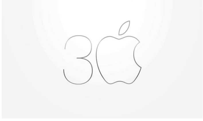
Fig. 5. Apple's 30th Anniversary Emblem and Logotype

We see the same approach in Apple's 30<sup>th</sup> anniversary emblem and logotype (See Figure. 5). The number "0" of "30" is replaced by the worldwide known symbol of Apple. The most significant point in this logotype is that the color, tone and form of the numbers and the symbol is blended into each other in a way to create unity. The simplicity of the emblem is so effective in both examples (see Figure 4 and 5) that the designers did not need to add the word "years". It can be easily understood that the emblem and logotype is designed for celebrating the 30<sup>th</sup> anniversary of Apple. Of course the strong image of Apple's corporate identity plays an important role in the means of being memorable and significant. It is easily remembered as well as recognized for the corporate identity. A strong corporate identity provides a company or a brand to step forward among others in today's marketing conditions (Wheeler, 2012).