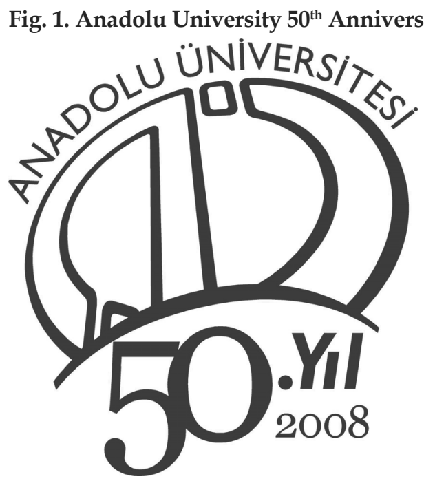
Fig. 1. Anadolu University 50th Anniversary Emblem and Logotype.