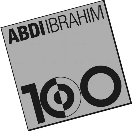
Fig. 4. Massimo Vignelli: "Abdi İbrahim 100th Anniversary Emblem and Logotype"